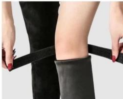
Non-slip straps for high boots