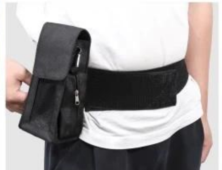
Organization of Sundries