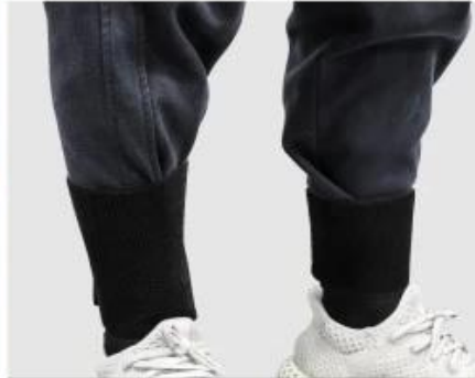
Windproof cuff strap