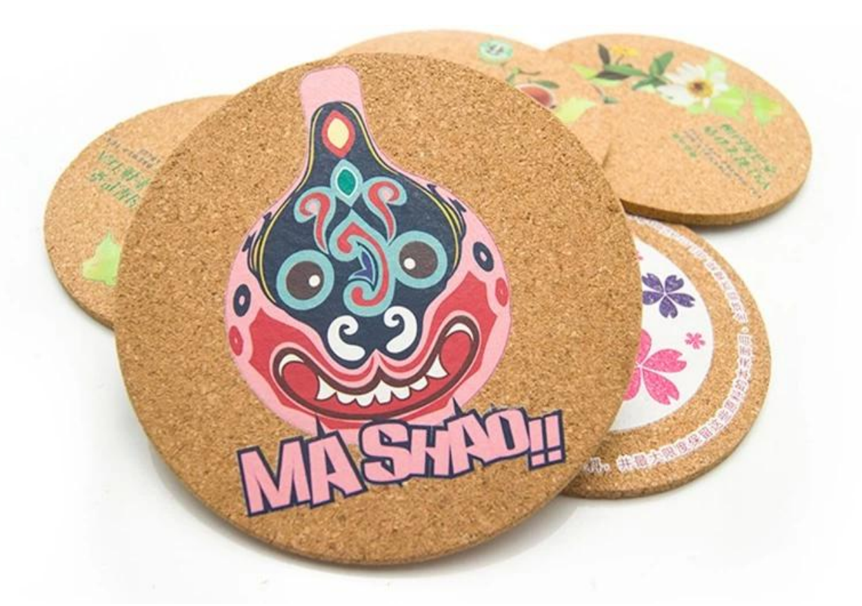
Hot stamping coaster