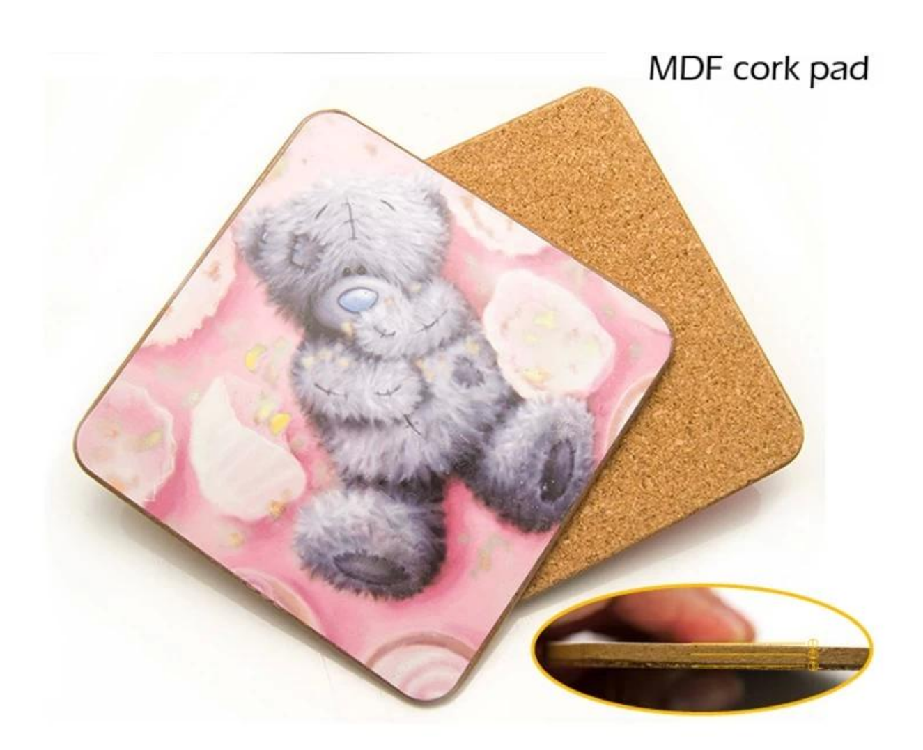
MDF cork pad