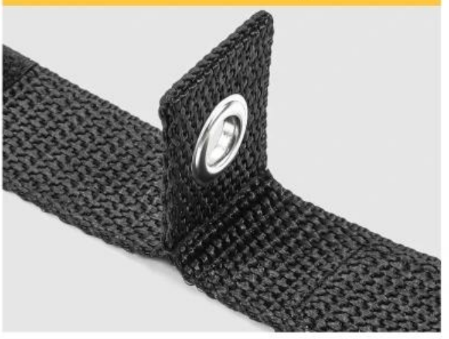
Position with metal holes cannot be torn open