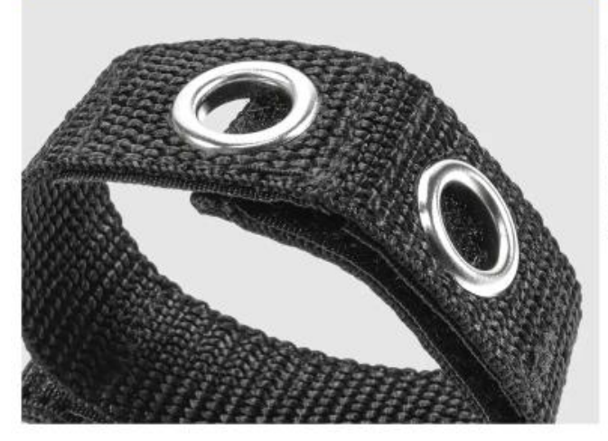
Position with metal holes can be torn open