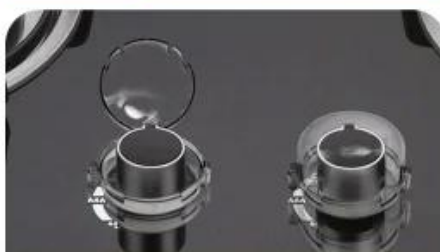
Stove knob cover