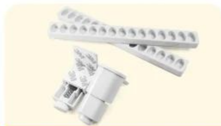
Sliding window lock