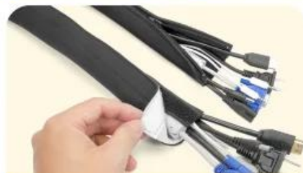
Cable management sleeves