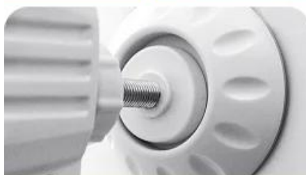
Wall guard pad