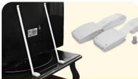
Furniture anti-tip straps