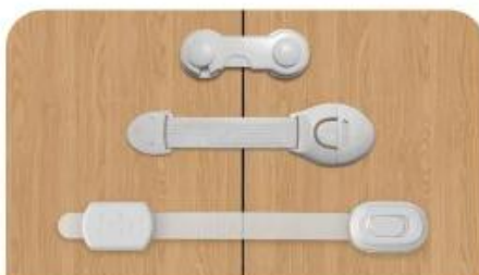
Safety cabinet lock