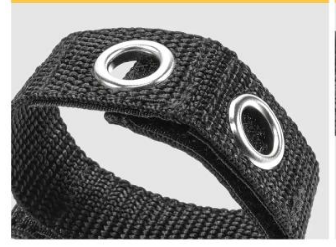
Position with metal holes can be torn open