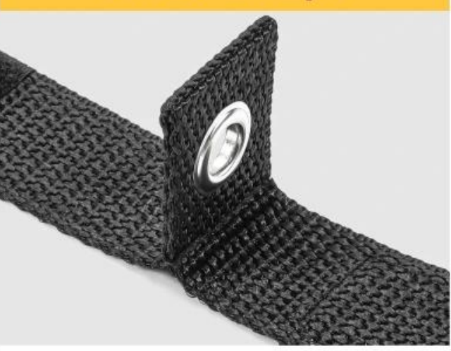
Position with metal holes cannot be torn open