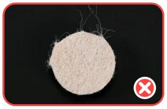
The felt pad after peelling off is irregular and the felt is loose