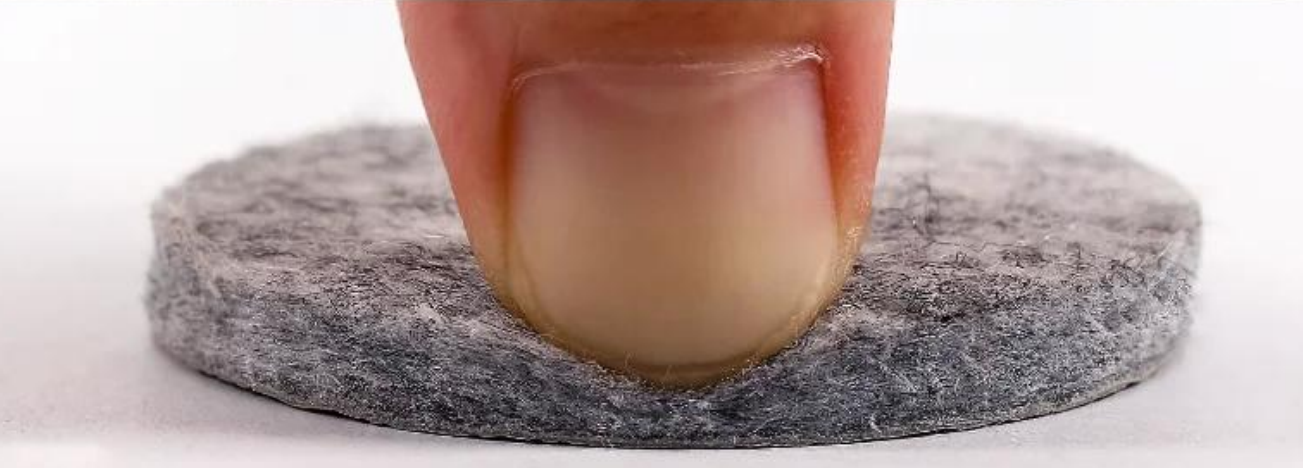
Anti-collision and anti-vibration Soft felt material, prevent vibration and protect the furniture