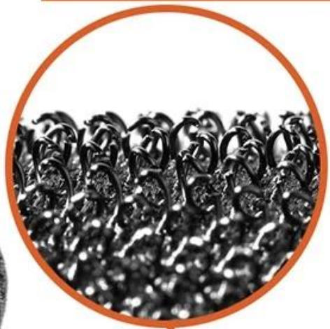
NEAT HOOK TAPE