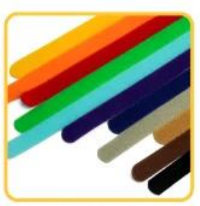
Multiple color options