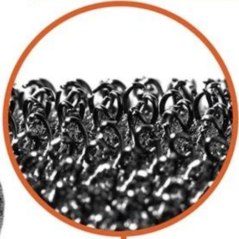
NEAT HOOK TAPE