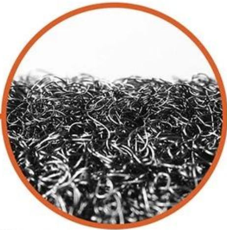
SOFT LOOP TAPE