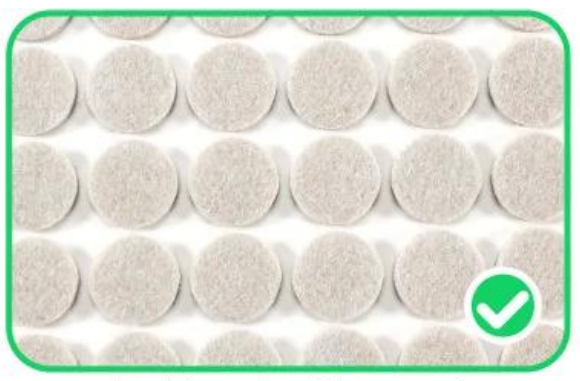
We make felt pads with 2mm distance between each other