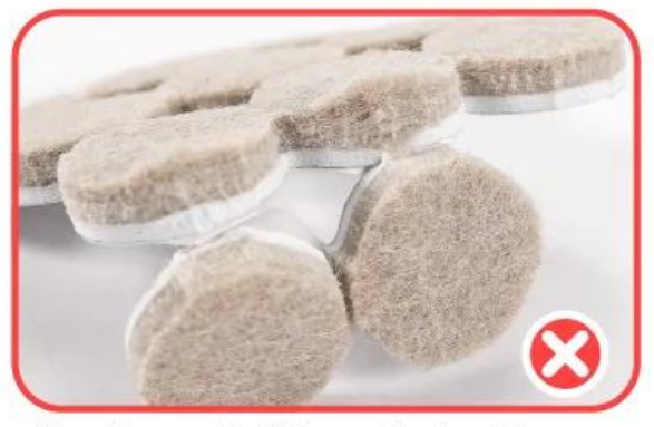
Hard to peel off from the backing paper and easily damaged.