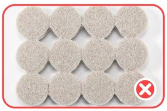
Other factories make the felt pads connected each other