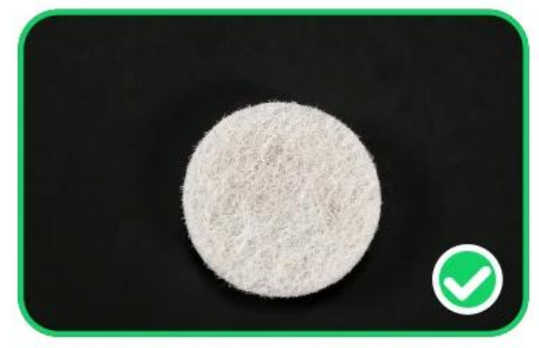
Each felt pad after peelling off is perfect, beautiful and tight