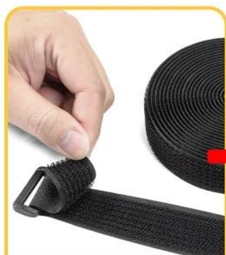
Install the buckle