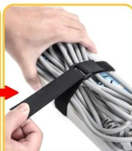
Tighten and stick