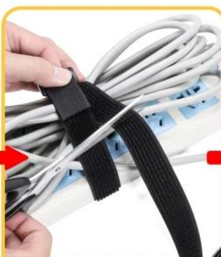
Cut to the appropriate length