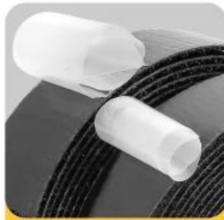
PE release film