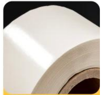
Grashen release paper

We have a wide selection of materials ( PET film, PE film, silicone coated paper and Grashen release paper ) to meet the different needs from customers