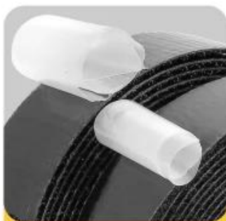
PE release film