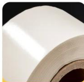
Grashen release paper

We have a wide selection of materials ( PET film, PE film, silicone coated paper and Grashen release paper ) to meet the different needs from customers