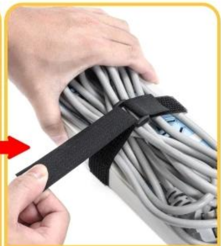
Tighten and stick