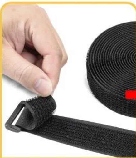
Install the buckle