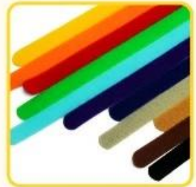
Multiple color options