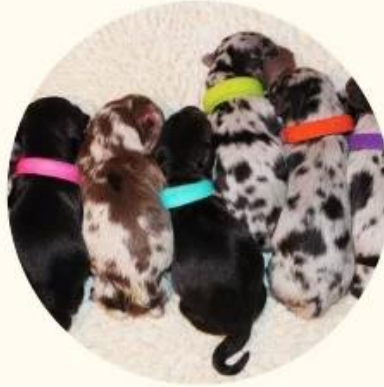
Pet ID band