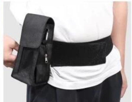
Organization of Sundries