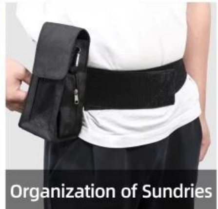
Organization of Sundries