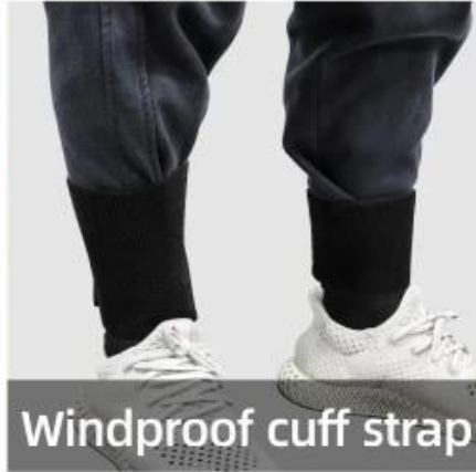
Windproof cuff strap