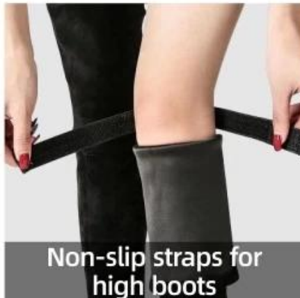
Non-slip straps for high boots