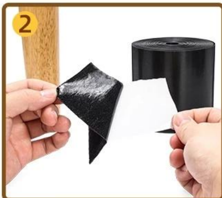
2 Tearing the back release paper