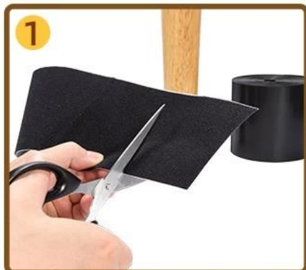
1 Cutting an adhesive soft fabric loop of suitable length