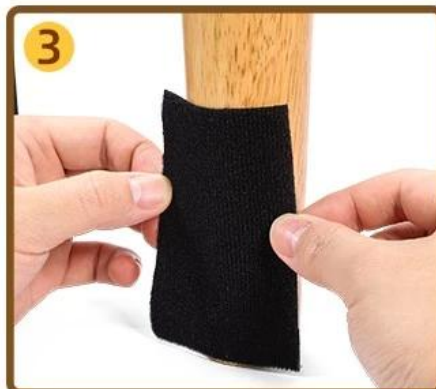
3 Attaching adhesive soft fabric loop to the feet of sofa/the feet of bed