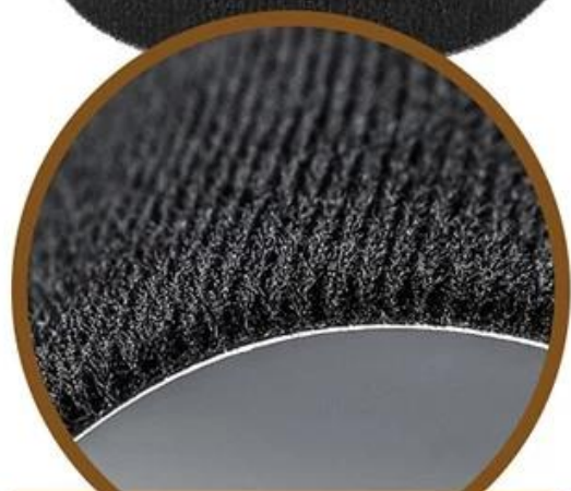
Adhesive soft loop