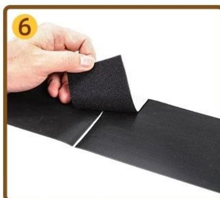
6 If the length of the plastic hook is not enough, the length of soft fabric loop connection can be used