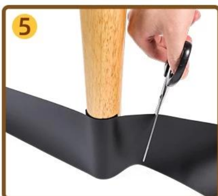
5 Using scissors to cut out the excess part of the plastic hook