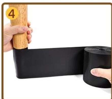
4 Sticking the plastic hook around the feet of sofa /the feet of bed