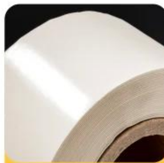
Grashen release paper