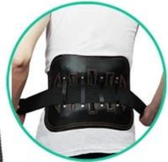
Waist protective belt