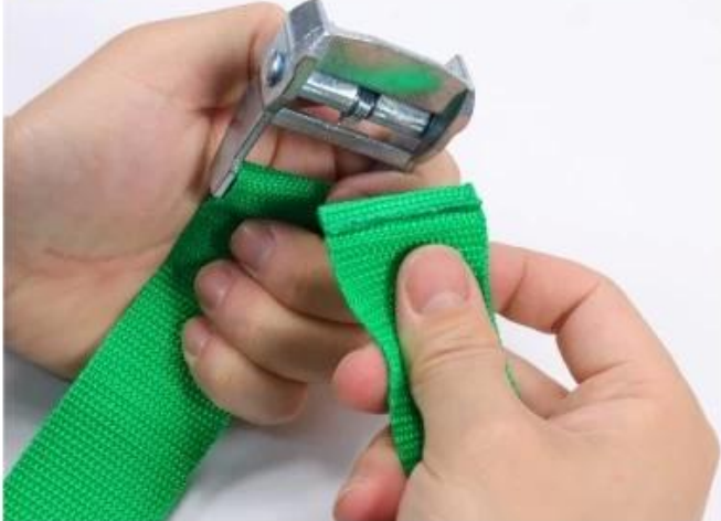
The webbing goes from the bottom to the top