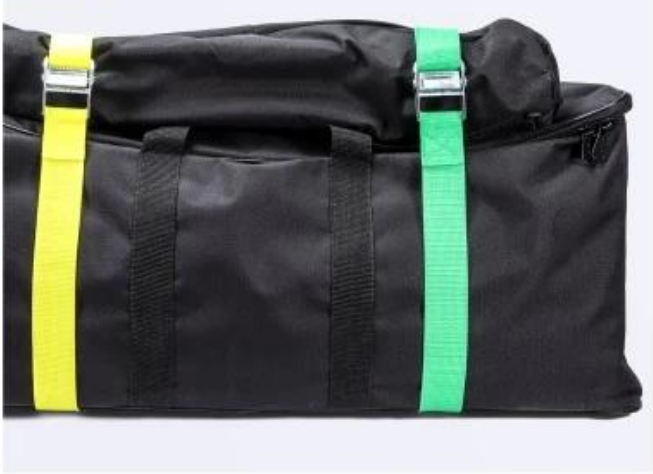
Tie items, tighten the webbing on it