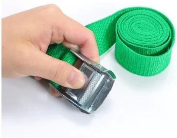
Press down the press button