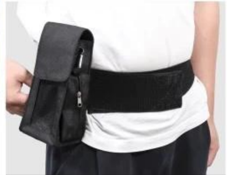
Organization of Sundries