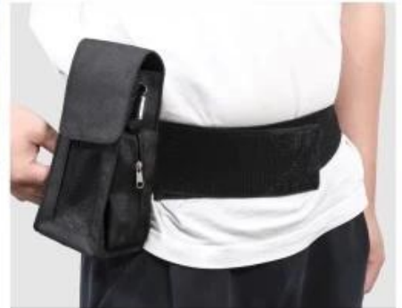
Organization of Sundries