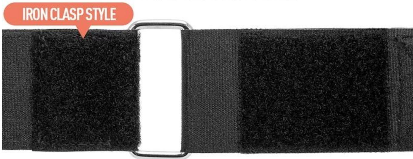
IRON CLASP STYLE

Iron clasp style and rubber buckle style can be customized It can be adjusted according to your requirement not easy to deform and break