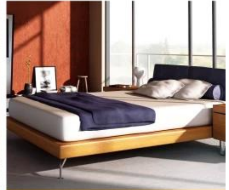
Foot of the bed