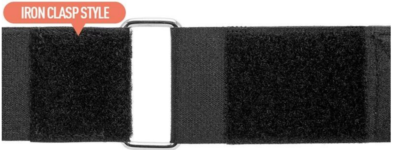
IRON CLASP STYLE

Iron clasp style and rubber buckle style can be customized It can be adjusted according to your requirement not easy to deform and break