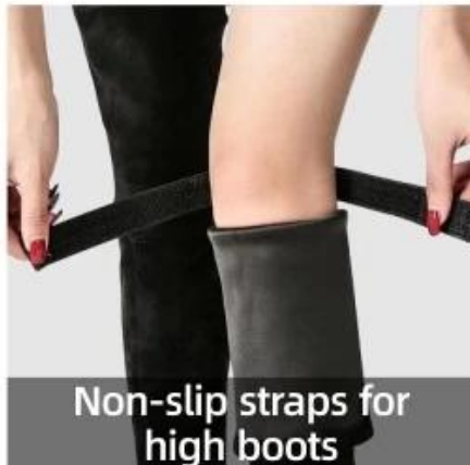
Non-slip straps for high boots