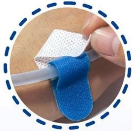
No Harm To The Skin