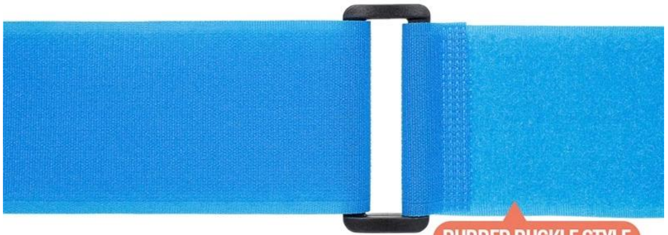
RUBBER BUCKLE STYLE

Iron clasp style and rubber buckle style can be customized It can be adjusted according to your requirement not easy to deform and break