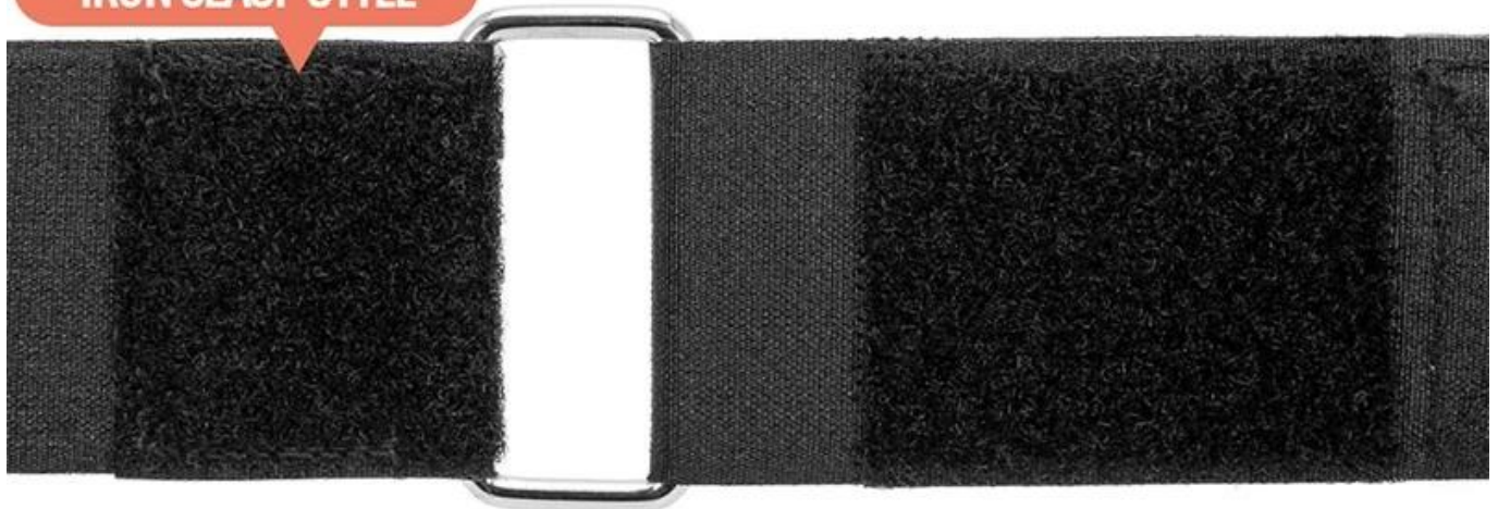
IRON CLASP STYLE

Iron clasp style and rubber buckle style can be customized It can be adjusted according to your requirement not easy to deform and break