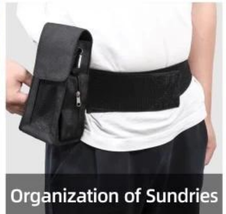
Organization of Sundries