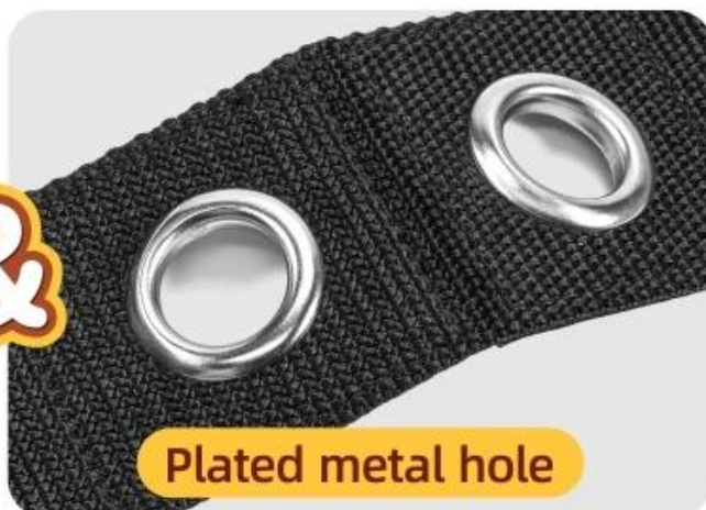
Plated metal hole