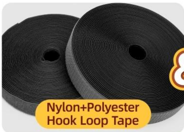
Nylon+Polyester Hook Loop Tape