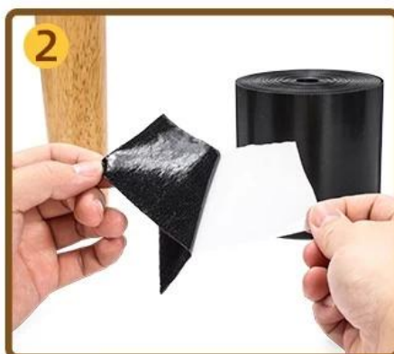
2 Tearing the back release paper