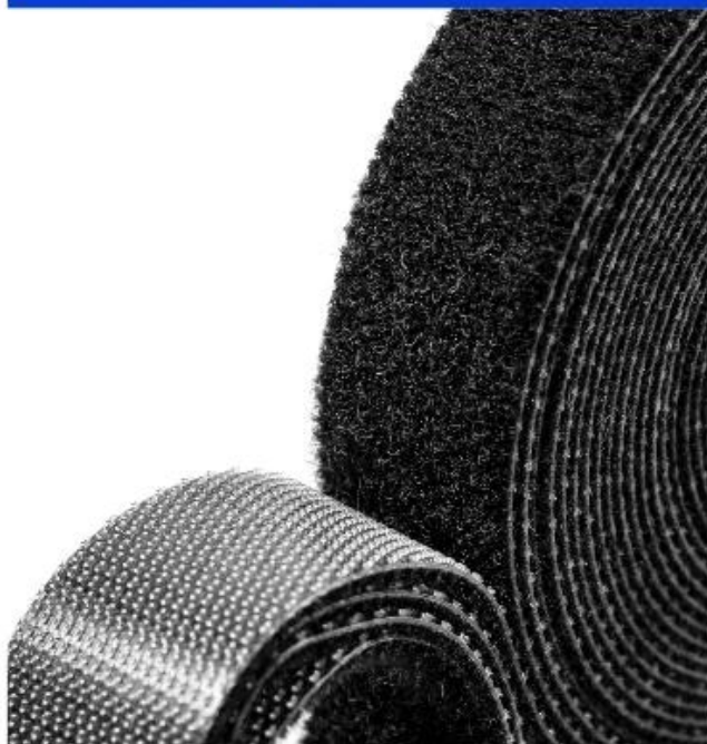
Hook and loop almost keep the original