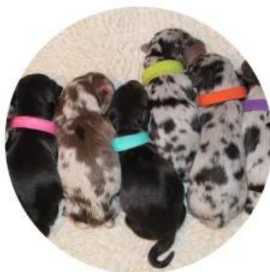
Pet ID band