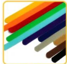
Multiple color options