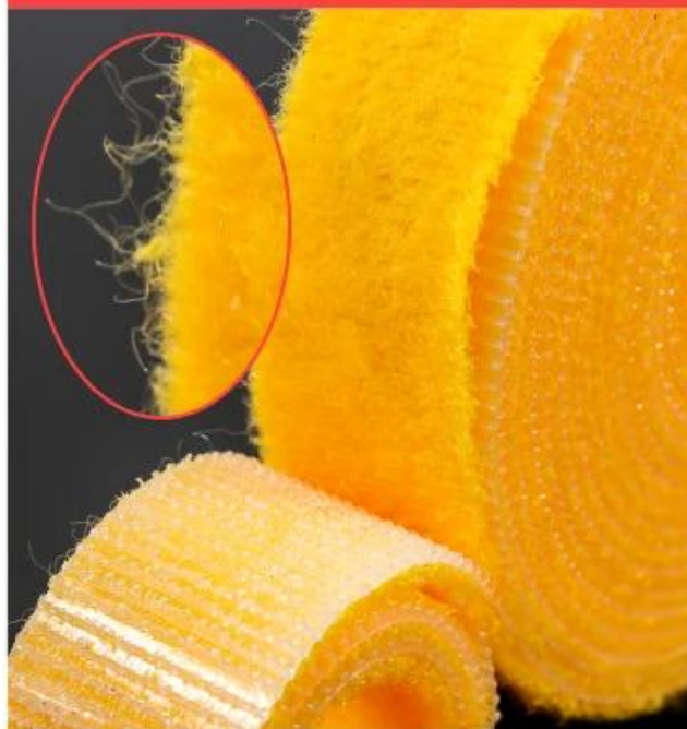
The loop got loose and the hook has been straightened