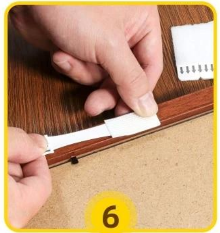
When you need to remove it, Pull the arrow down slowly to detach the strip from the wall