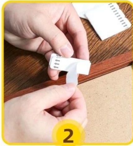
Remove one side of the sticker