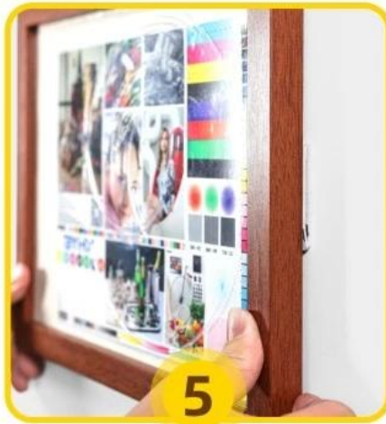
Stick the frame firmly on the wall