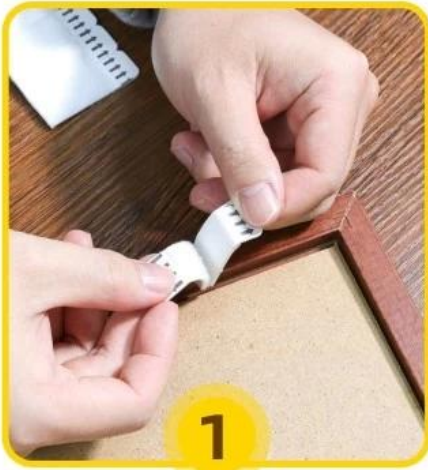
The hook adheres to the loop