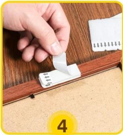
Tear the other sticker