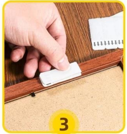
Stick it to the back of the frame and press firmly