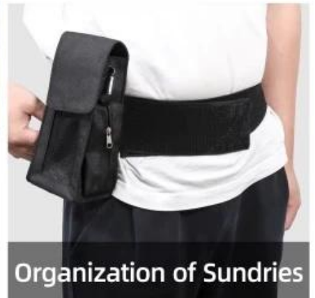
Organization of Sundries