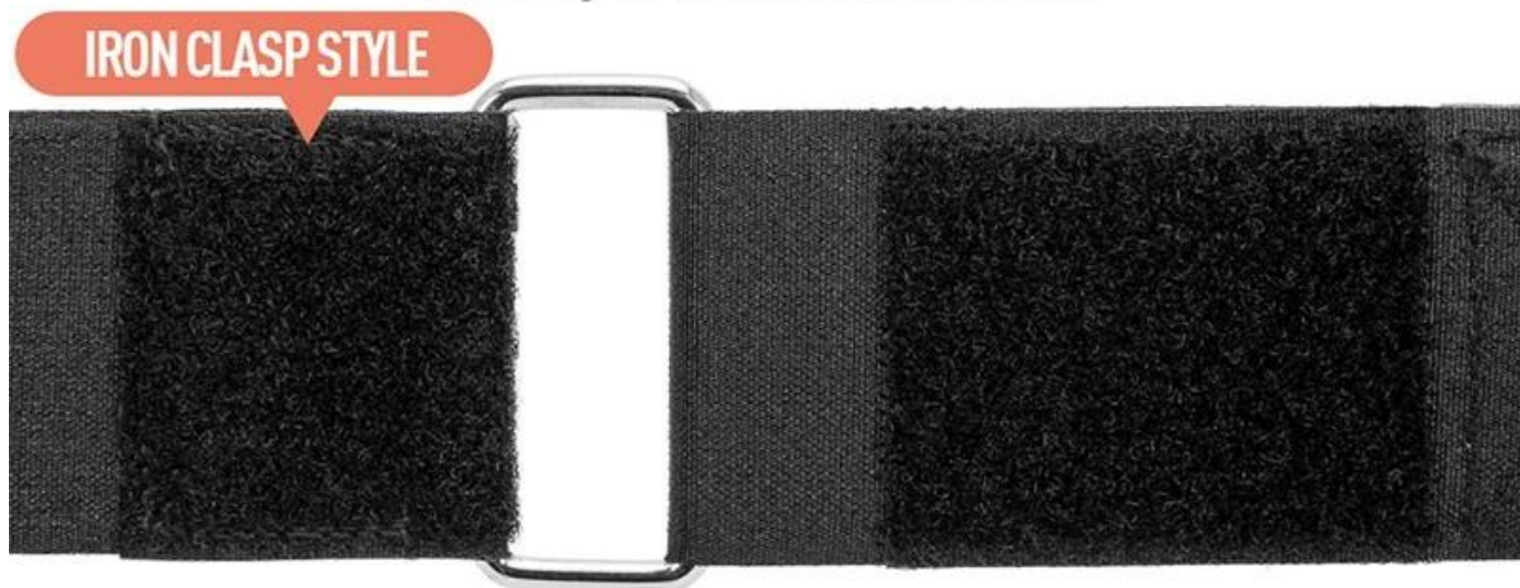
IRON CLASP STYLE

Iron clasp style and rubber buckle style can be customized It can be adjusted according to your requirement not easy to deform and break