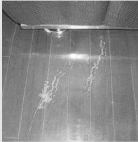
Floor wears when moving furniture