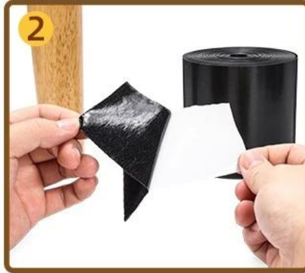
2 Tearing the back release paper