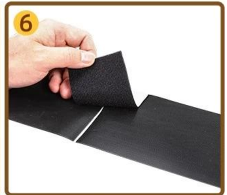
6 If the length of the plastic hook is not enough, the length of soft fabric loop connection can be used