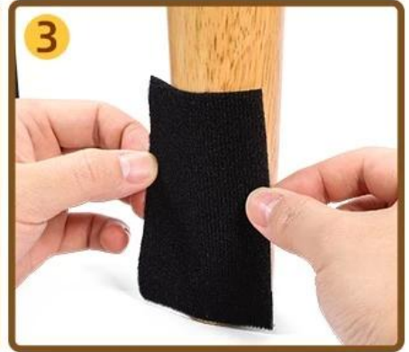
3 Attaching adhesive soft fabric loop to the feet of sofa/the feet of bed