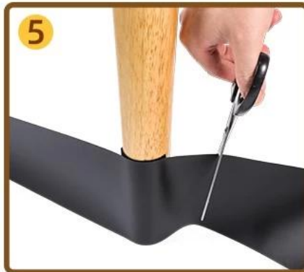
5 Using scissors to cut out the excess part of the plastic hook