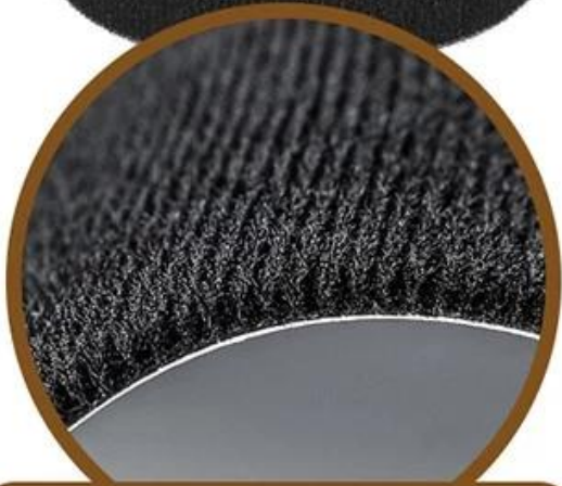
Adhesive soft loop