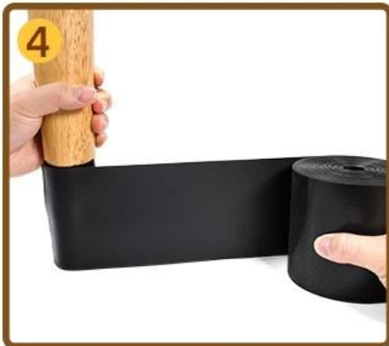
4 Sticking the plastic hook around the feet of sofa /the feet of bed