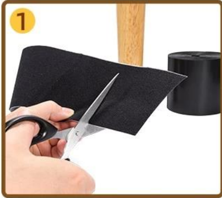
1 Cutting an adhesive soft fabric loop of suitable length