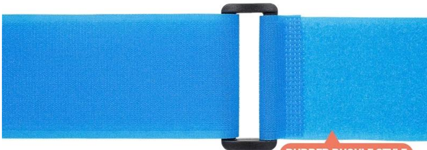
RUBBER BUCKLE STYLE

Iron clasp style and rubber buckle style can be customized It can be adjusted according to your requirement not easy to deform and break