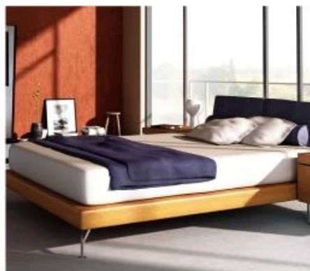
Foot of the bed