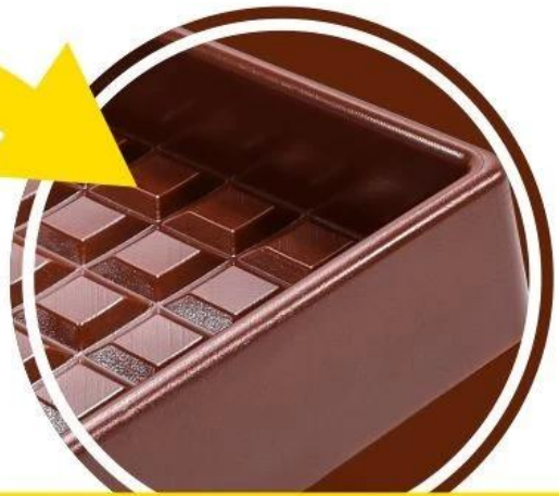
Safe & Sturdy Material