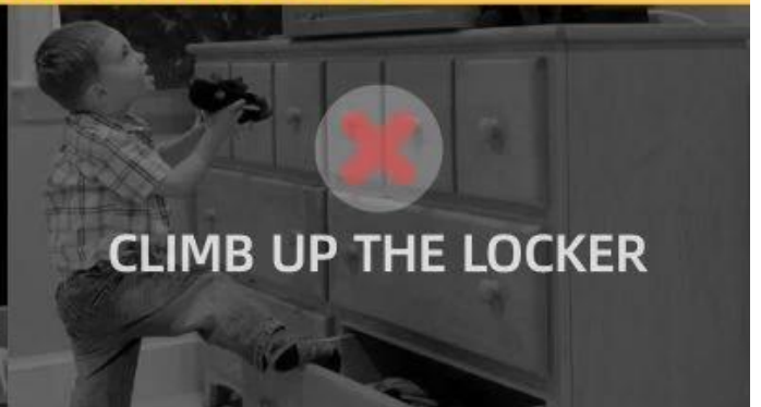
CLIMB UP THE LOCKER